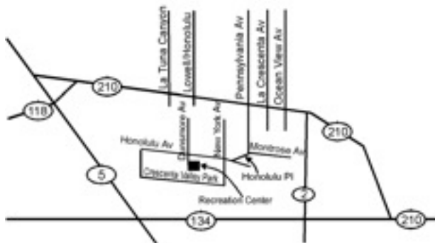
Thomas Guide 534-E-1

Crescenta Valley Regional Park Recreation Center Dunsmore & Honolulu, La Crescenta