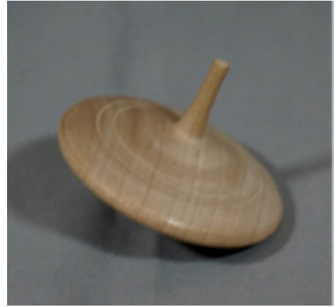
Cody Travis' maple entry had wax finish.