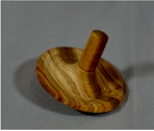
Henry Koch used Canary wood (and no, it didn't sing).