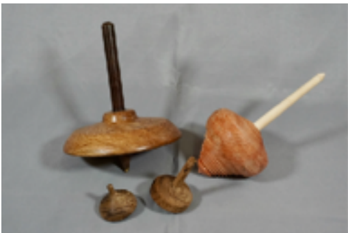
Despite the name, The Four Tops " by Mark Fitzsimmons didn't sing either. Black acacia, oak, walnut & brass, carob, birch, brass.