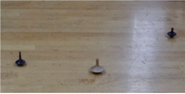
"just keep spinnin, spinnin, spinnin..." (Sorry, Dory!)