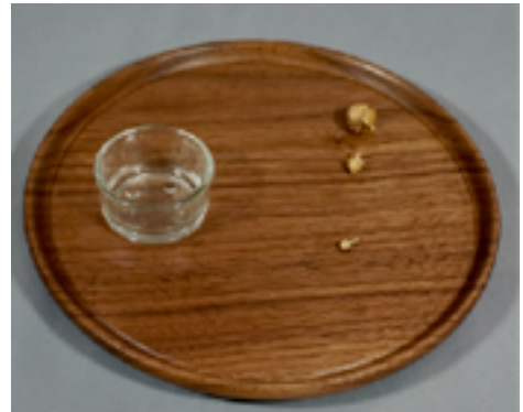
Sarzena Bhargava's acorn tops were fashioned from water oak.