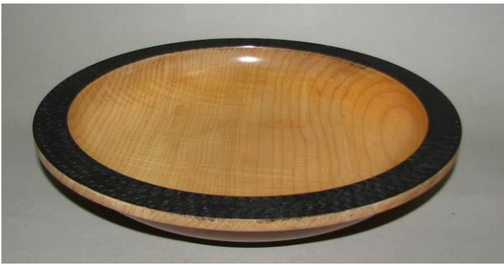
Steve Veenstra brought in a platter turned out of Mahogany and finished with walnut oil.