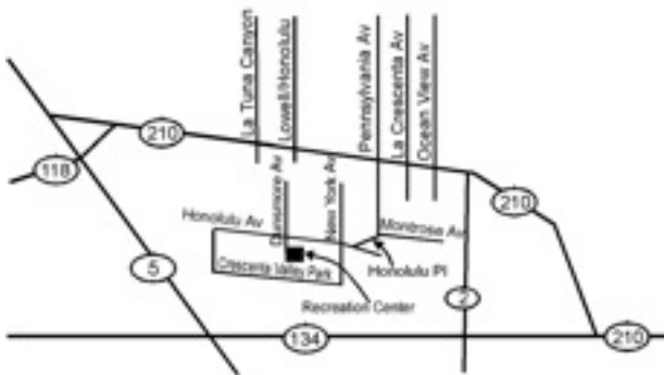
Thomas Guide 534-E-1

Crescenta Valley Regional Park Recreation Center Dunsmore & Honolulu, La Crescenta