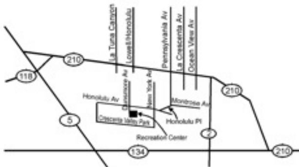
Thomas Guide 534-E-1

Crescenta Valley Regional Park Recreation Center Dunsmore & Honolulu, La Crescenta