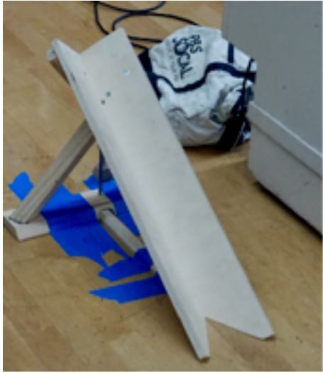
The Starting Ramp