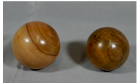
Dale Gertsch's entries, camphor and magnolia