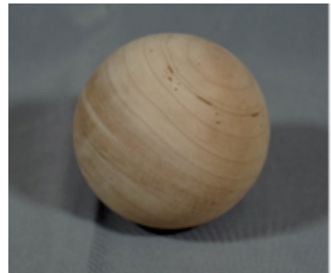
Thomas Cassidy's straight roller.