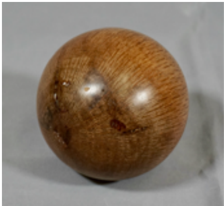
Rick Silverstein's oak roller finished with friction polish.