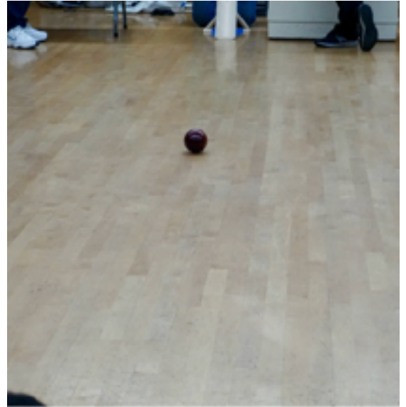
On its Way!