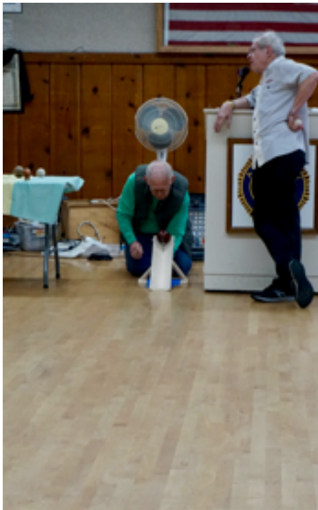
Ready on the Firing Line!