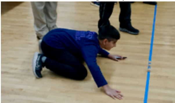
Our Linesman, in charge of seeing where each ball crossed the line.