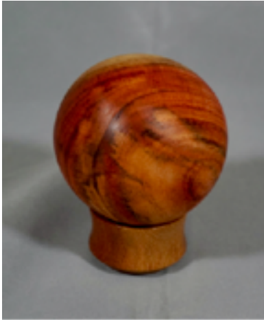
Carey Caires' carob orb was finished with Butcher Block Oil